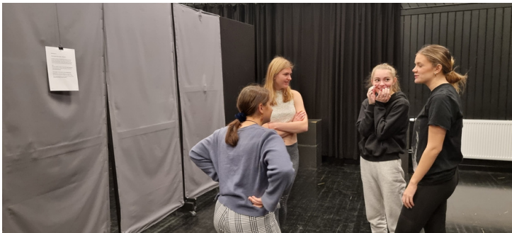
Thor with friends in store